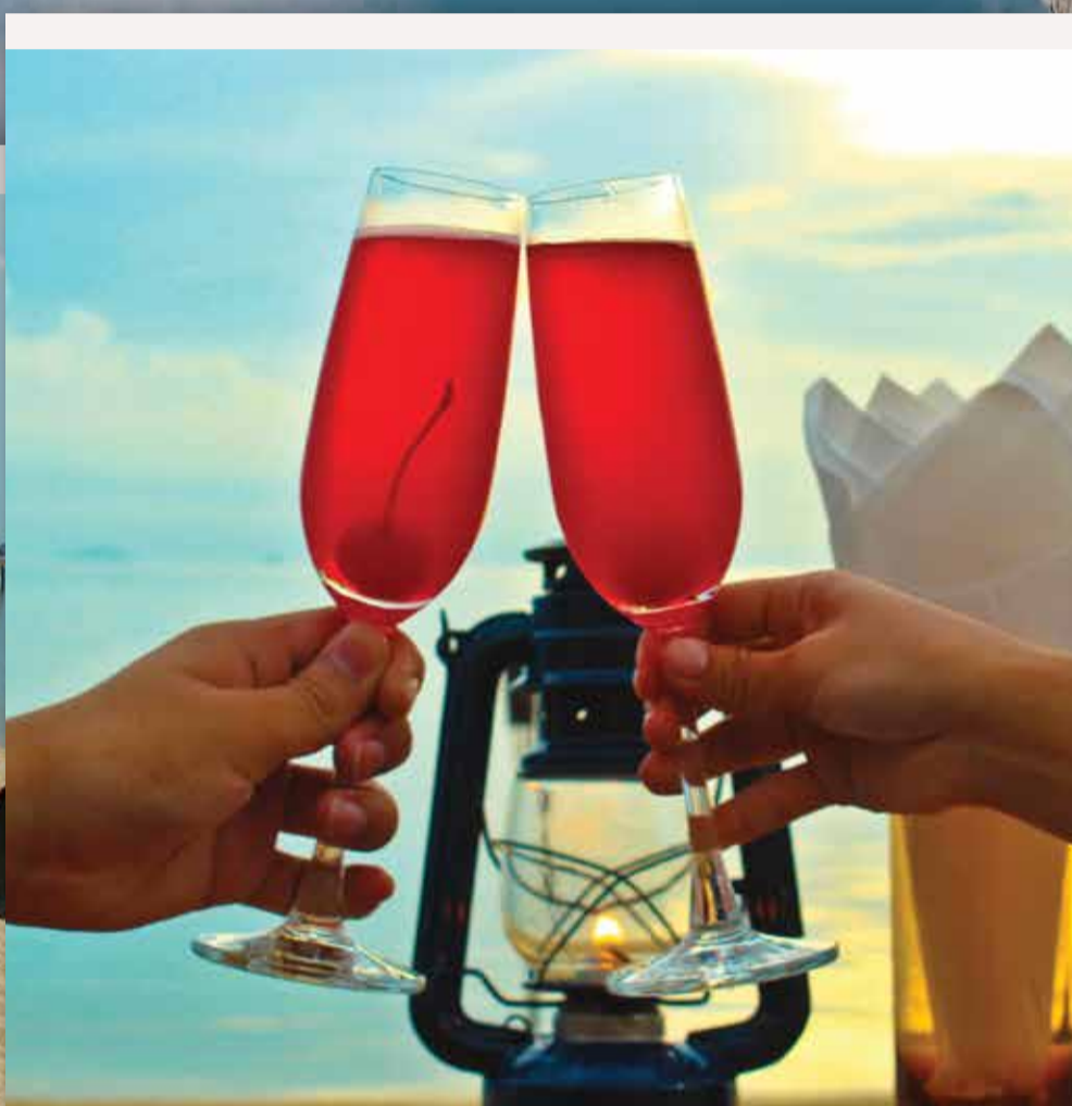
Koh samui's Best Sunset