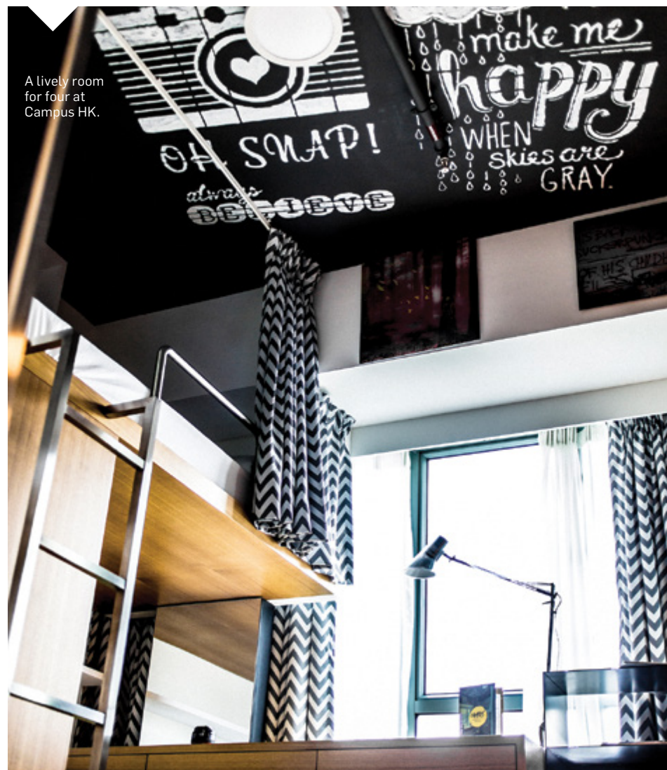
A lively room for four at Campus HK.

From a Hindu purification ritual in Bali to a paddleboard tour of mangroves in Thailand, these offers keep you balanced, both mentally and physically.